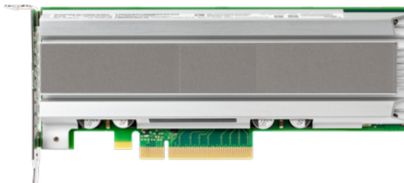
Fig 2: Flash Accelerator PCIe Card

This performance is orders of magnitude faster than traditional storage array architectures, and it is also much faster than current all-Flash storage arrays. These are real-world end-to-end performance figures measured running SQL workloads with standard 8K database I/O sizes inside a single rack Exadata system, unlike storage vendor performance quotes that are usually based on small I/O sizes and low-level I/O tools and therefore are many times higher than can be achieved from SQL workloads.