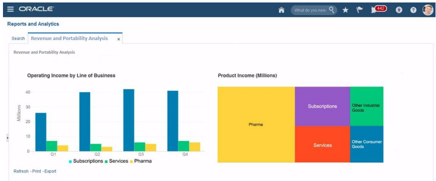
Figure 2: Supporting References Analysis

provide broader insight into the business. For example, balances based on geographies, channel, industry, investment type, fund manager or product category can be maintained without including these key business dimensions in the chart of accounts. This central infrastructure significantly offloads the burden on the chart of accounts, keeping it lean and efficient for financial reporting. As the business grows, new supporting references can be added to support expanded analysis without changing the chart of accounts. These attributes of the source transaction are stored in the accounting repository, readily available to support business analysis and decision making.