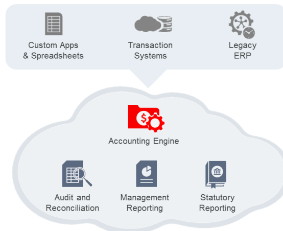
Figure 1: Oracle Accounting Hub Cloud Platform

As an integrated accounting platform, Oracle Accounting Hub Cloud standardizes the accounting from multiple third party transactional systems to consistently enforce accounting policies and meet multiple reporting requirements in an automated and controlled fashion, and with minimal disruption to existing financial processes. The core capability of Accounting Hub is the robust accounting engine, delivering flexible configuration that captures rich elements from customers' existing business systems.